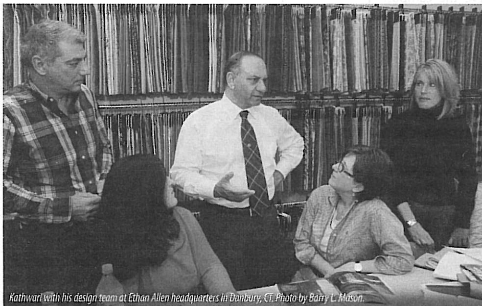
Kathwari with his design team at Ethan Allen headquarters in Danbury, CT.

Chairman and Chief Executive Office of Ethan Allen Interiors, Inc.