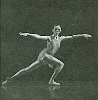
Evolve Dance Inc. with the YMCA A13