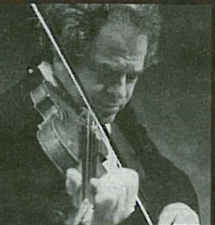
Itzhak Perlman Debut A5