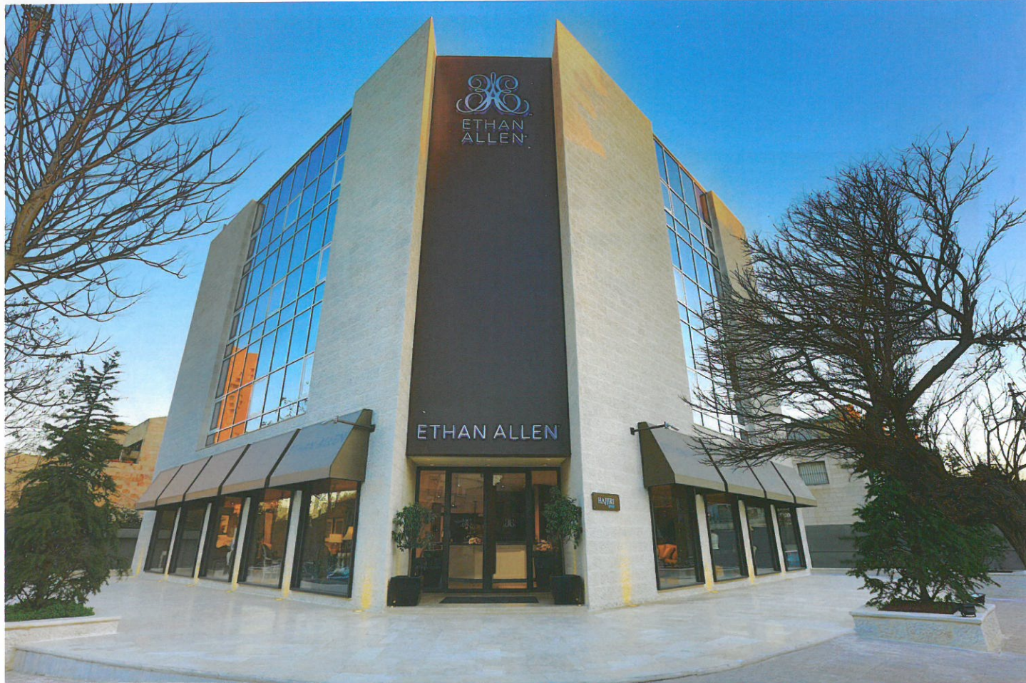
The shopfront of the new Ethan Allen Design Centre in Jabal Amman.