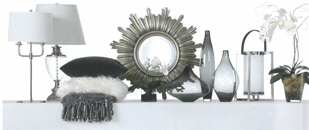
Ethan Allen offers a vast array of wonderful décor and textiles to complete your interior space