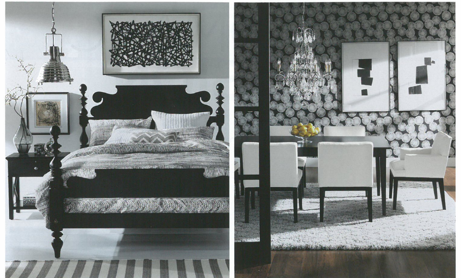
Contemporary, abstract patterns and classic pieces work to create a covetable eclectic look; the current design focus at Ethan Allen

He highlights that the time for designs to become irrelevant is becoming shorter and shorter in today's fast passed consumer society. “We have lots of talented people in all areas and our interior designers also play a very important role because they give lots of ideas, they are studying what is taking place in fashion,” says Farooq. Adding that the industry is now a fashion industry no longer a furniture business, because people want to dress their homes in a fashionable way, as they dress themselves.