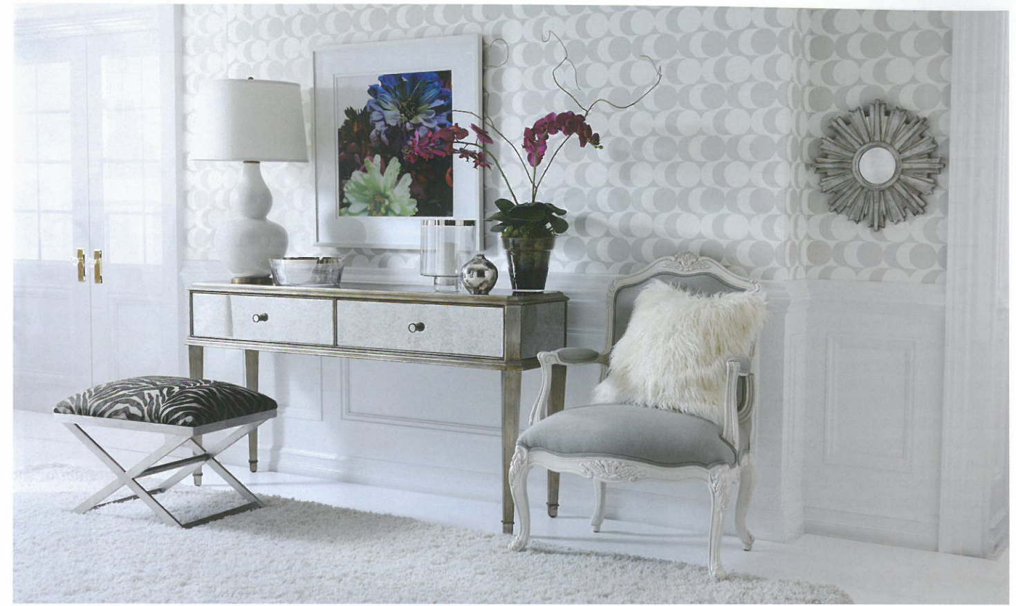
Statement furnishings in a soothing colour palette and metallic accents, are expertly combined in this setting at Ethan Allen

Trendesign tours the new Ethan Allen Design Centre in Amman, as the brand's legacy of design excellence is reinvigorated by emerging contemporary preferences.